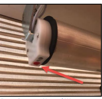
Reset Button - Natural Woven