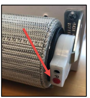
Reset Button - Roller